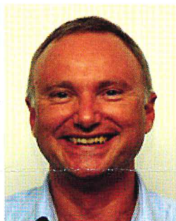
Professor Tony Attwood